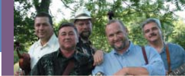
Whitewater Bluegrass Company