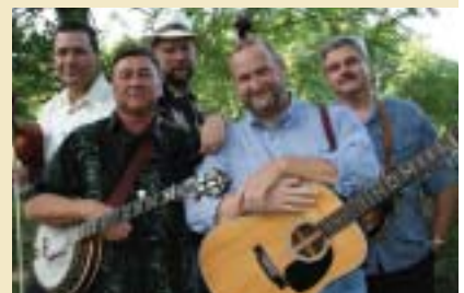
Whitewater Bluegrass Company