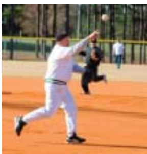
Power Slam Softball Tournament