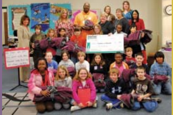
Hemby Bridge Elementary school students displaying blankets made from old auditorium curtains funded by Bright Ideas grant.