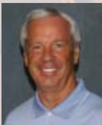
Coach Roy Williams

North Carolina's Touchstone Energy cooperatives are providing deserving students from across the state the opportunity to attend prestigious N.C. basketball camps again this year. The scholarships are being offered to rising 6-8th grade females to attend the Kay Yow Basketball Camp at N.C. State University and to rising 6-8th grade males to attend the Roy Williams Basketball Camp at UNC-Chapel Hill. North Carolina's Touchstone Energy cooperatives will send more than 50 students to the camps in 2009.