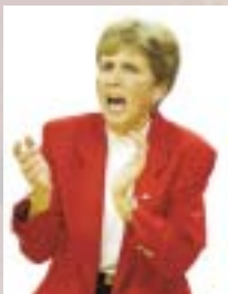
Coach Kay Yow